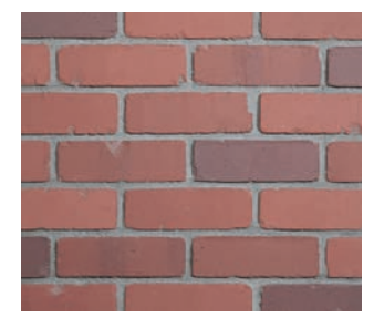
OLD SACRAMENTO BLEND