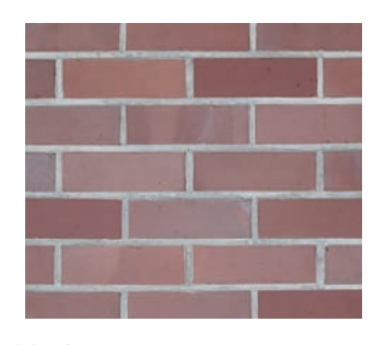
MONTEREY BAY FLASHED